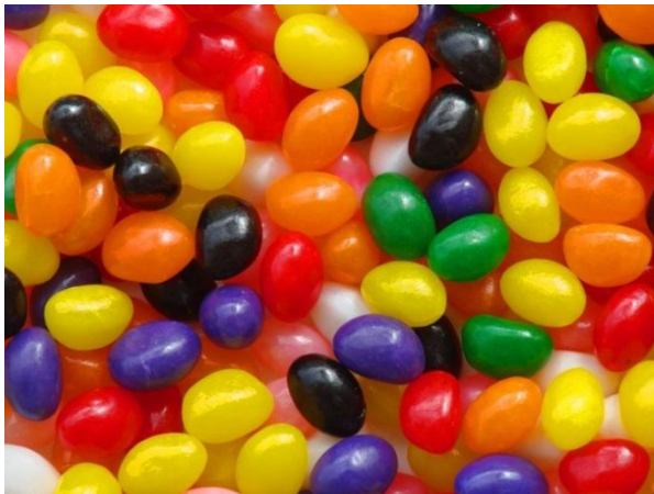
Title: Colour & Unity/Harmony