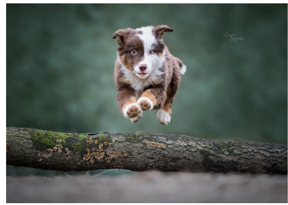
Action Photos (Sports Mode)