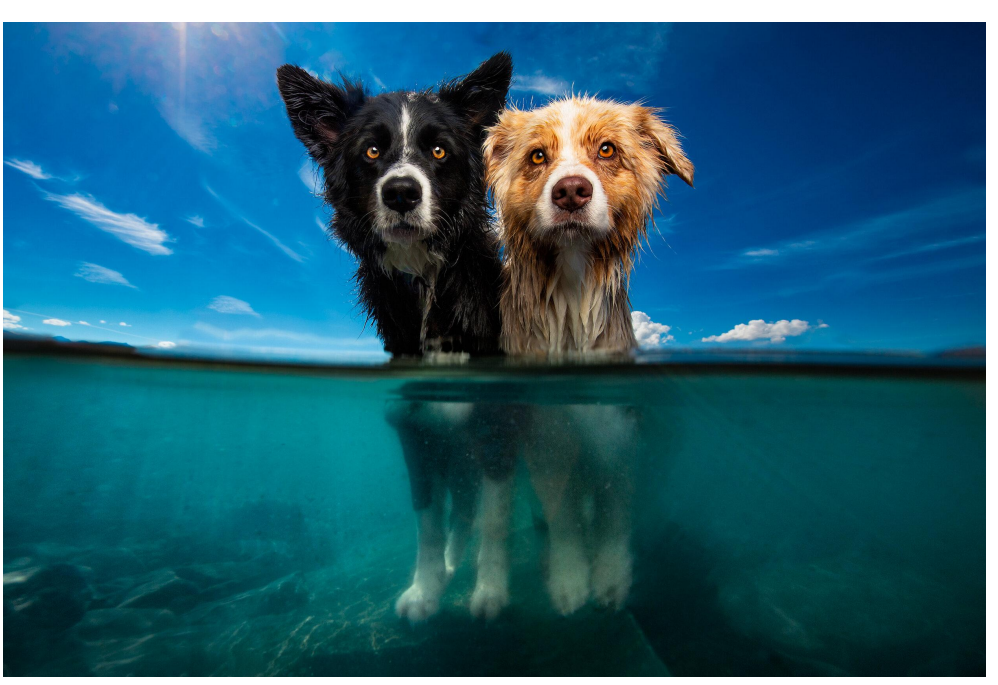
Dramatic Lighting & Angles