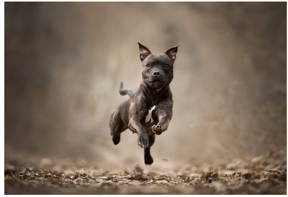
Depth of Field & Rule of Thirds