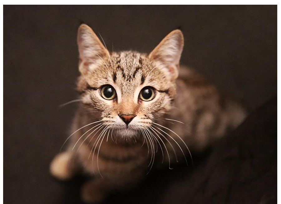
10 Tips to Improve Your Pet Photography