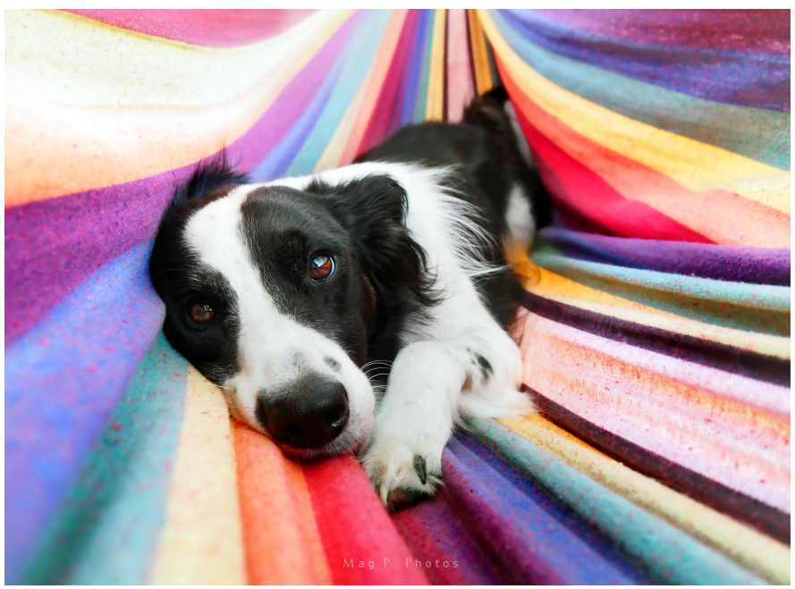
Depth of Field & Colour