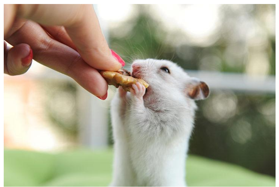
8 Tips for Better Pet Photography