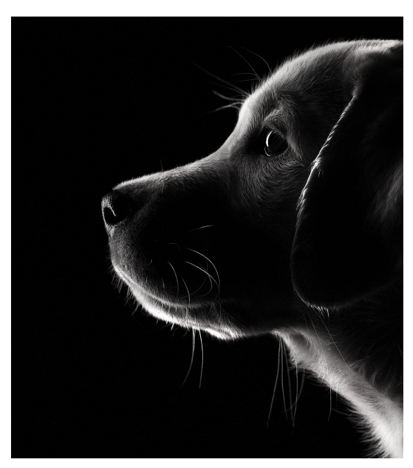
Tips for Great Lighting for Pet Photography